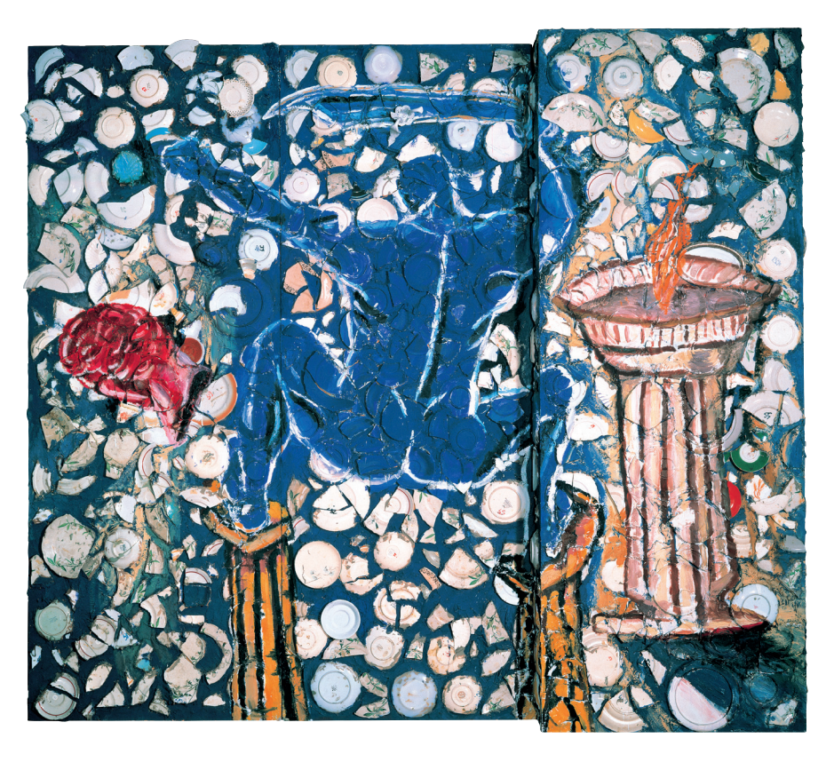
Julian Schnabel Blue Nude with a Sword, 1979 oil, plates, and bondo on wood 96 x 108 x 13 inches (243.84 x 274.32 x 33.02 cm)

that make a spectacle. First, one sees the expanse of their boisterous surface. The paintings have wonderful bravura. The surfaces look physically quite turbulent. As we will see a lot is going on there, with a lot of stuff. That makes the surface restless and adventurous. They also seem impatient. Julian is an eager painter who cannot wait to finish a painting. Such urgency increases the restlessness of their appearance.