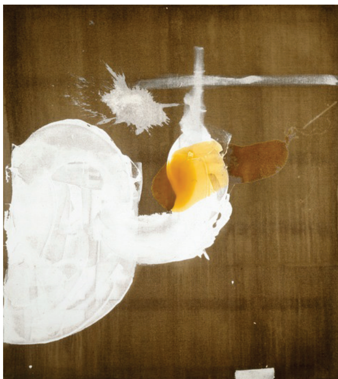
Julian Schnabel, "Untitled" (1990) Photo courtesy of Julian Schnabel, Artists Rights Society, and Gagosian Gallery

The Gagosian show comes with a characteristically romantic title that evokes a 19th-century oil study: "View of Dawn in the Tropics: Paintings, 1989-1990." It presents